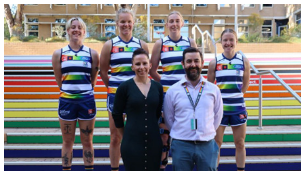
Deakin – Rainbow Road