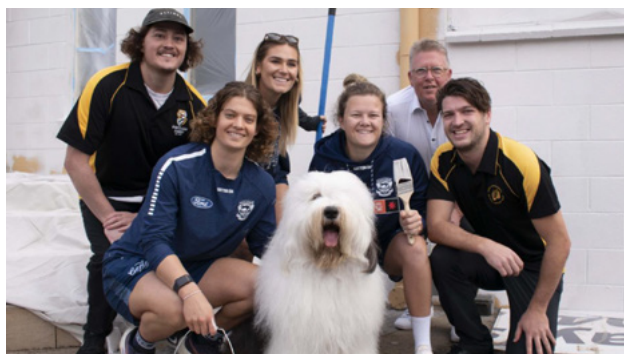
Dulux – Colour Your Club