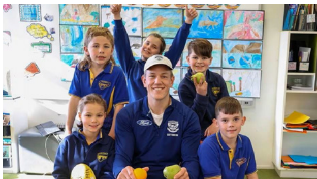
GMHBA – Healthy Heros