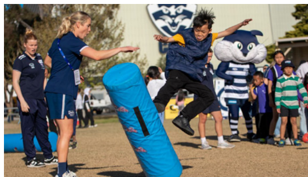
Viva – Welcome to Geelong