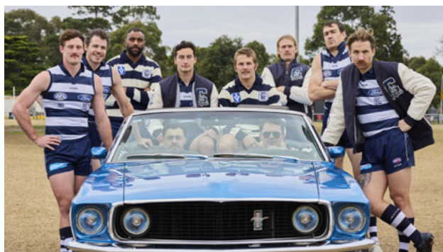
Ford and Cotton On – Retro Round