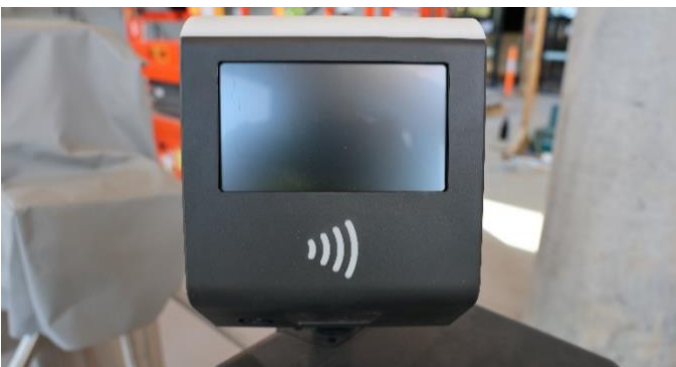
When I arrive, I need to scan my ticket and go through the gates.