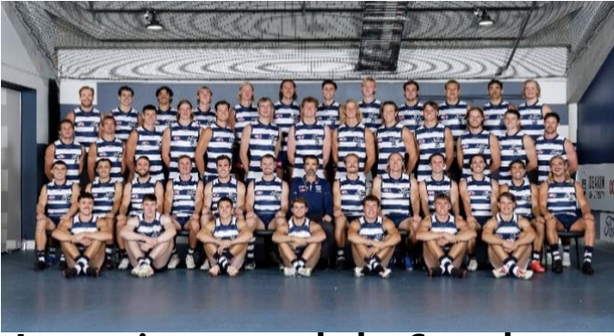
I am going to watch the Cats play an AFL game.