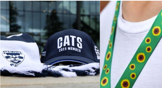
We might wear our beanies, scarves, or badges. I might wear my Sunflower Lanyard