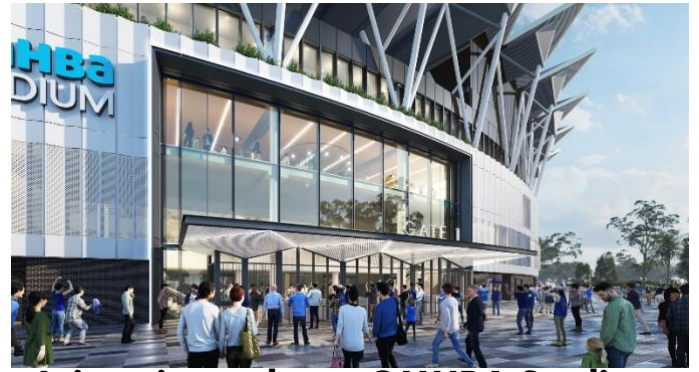
It is going to be at GMHBA Stadium