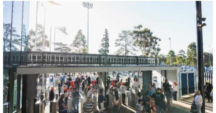
There will be a lot of other people at the stadium to watch the game too.