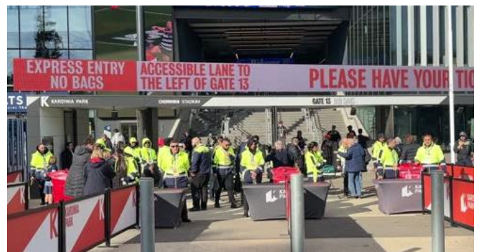
The security staff may use their wand or look inside my bag.